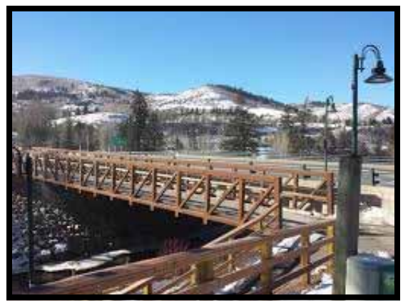
Bob the Bridge, Avon, CO